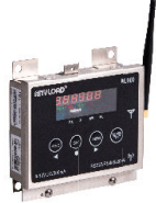
WL900 Wireless Transmitter