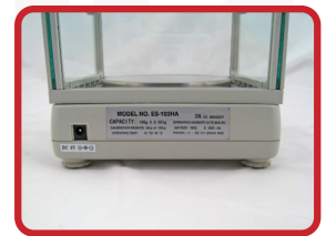
Removable Power Cord