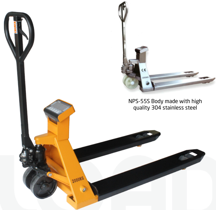
NPS-55S Body made with high quality 304 stainless steel